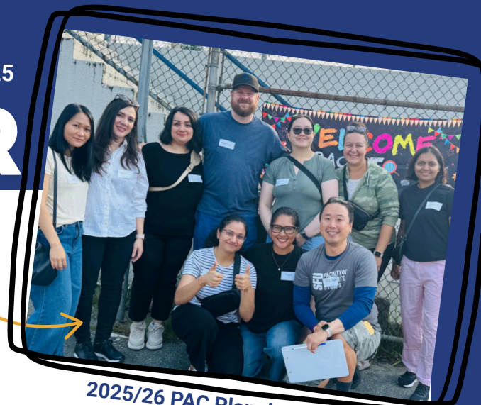
2025/26 PAC Planning Committee